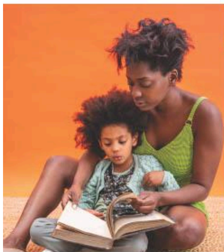
Sankofa Storytelling Program Grades 4-6