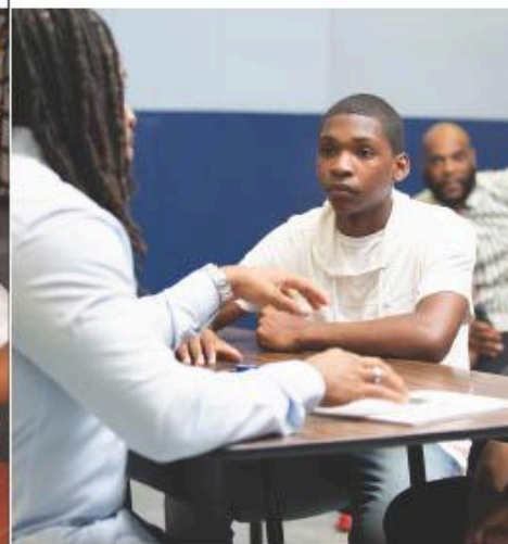
Sankofa Mentoring Program Grades 7-12