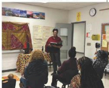
Parent Engagement & Workshops

Please join us and Share with your Network