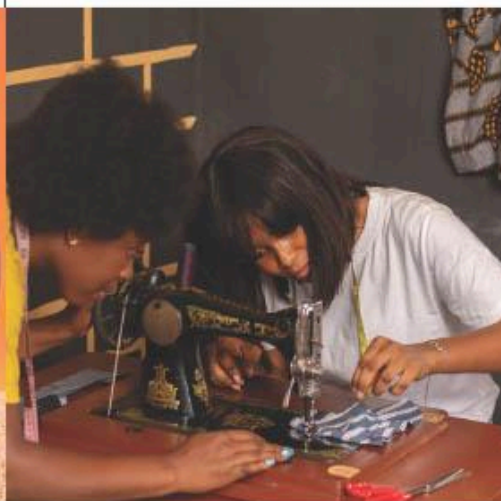
Sankofa Identity Program Grades 6-8