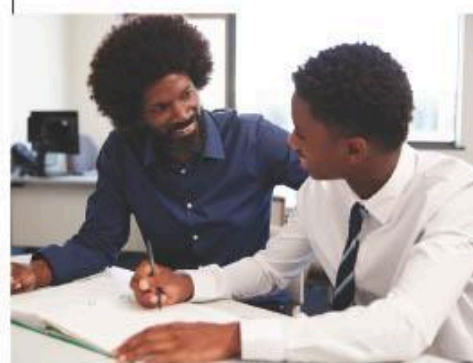
Tutoring Program Grades 4-12

Please join us and Share with your Network